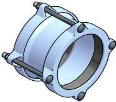
S - Range Couplings